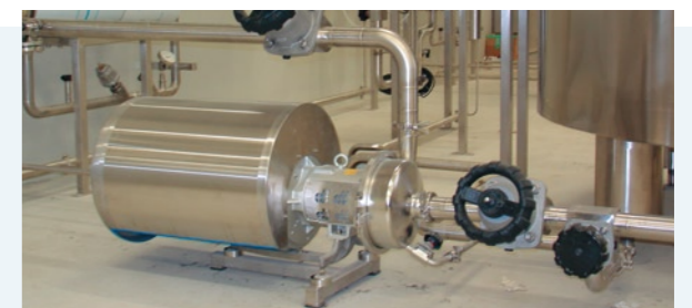
Loop circulation pump

We will supply the plant with whatever type of operating system you require: starting from manual operation by buttons and switches, and passing through control systems with operator control units or process visualisation, we can go all the way to instrumentation and control systems capable of controlling several workstations. Records can be kept of process-relevant data.