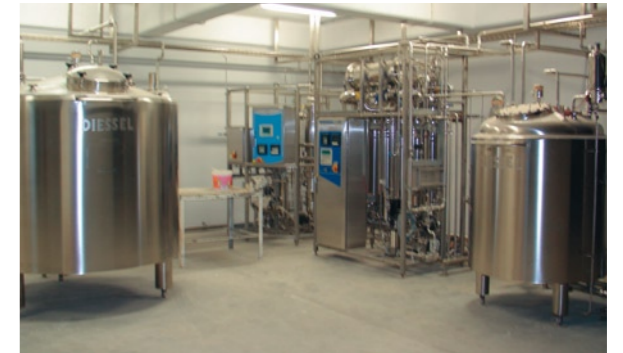
Highly purified water – Storage and distribution

Depending on your requirements, we deliver hot or cold storage systems for pure media. The disinfection method is adapted individually to the task. Flow velocity and pressure drop of each loop system are designed in accordance with the cGMP guidelines. Measuring and control instruments required for the monitoring of the water quality (TOC, conductivity, temperature) and of the flow rate belong to our standard. The aseptic design and the qualification of our plant consider the ISPE guidelines for water and steam systems and fulfil particularly the FDA requirements.