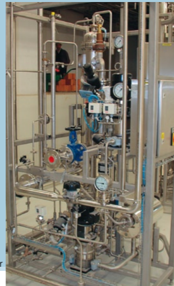
Clean steam generator

In order to be able to produce the requisite quantities of water in the quality laid down in USP and Ph Eur, water plant has to meet very exacting demands. A large number of national and international regulations and standards have to be complied with. Water apparatus is subject to very stringent control and inspection. GEA Diessel plant can fulfill these requirements.